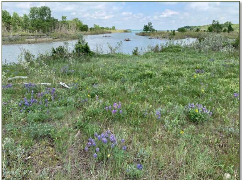
SALTS 2023 easement conserving riparian areas and adjacent grasslands along Drywood Creek.