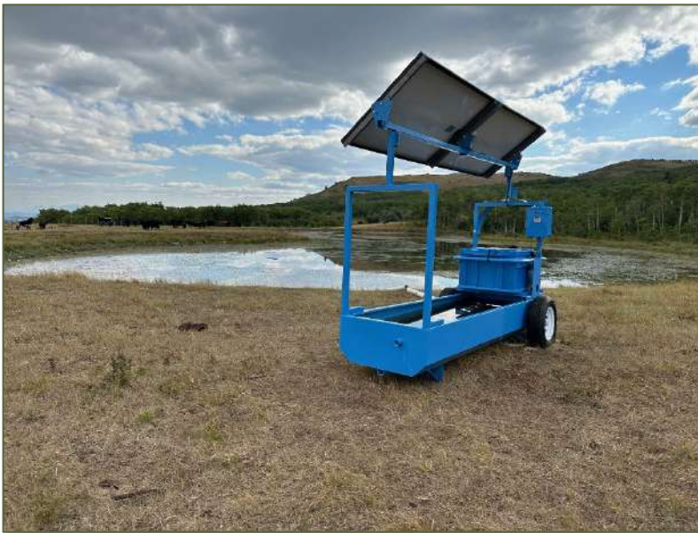
One of several solar waterers facilitated through SALTS in 2023 to support range and riparian management.

In 2023 SALTS worked with several partners to support range and riparian stewardship projects with our conservation easement landowners. These partners included Cows and Fish, Waterton Biosphere Reserve, the Alberta Government Watershed Restoration and Resiliency Program (WRRP), and the Weston Family Prairie Grasslands Stewardship Investment Program. Through these partnerships SALTS was able to facilitate 13 range and riparian stewardship projects with our landowners.