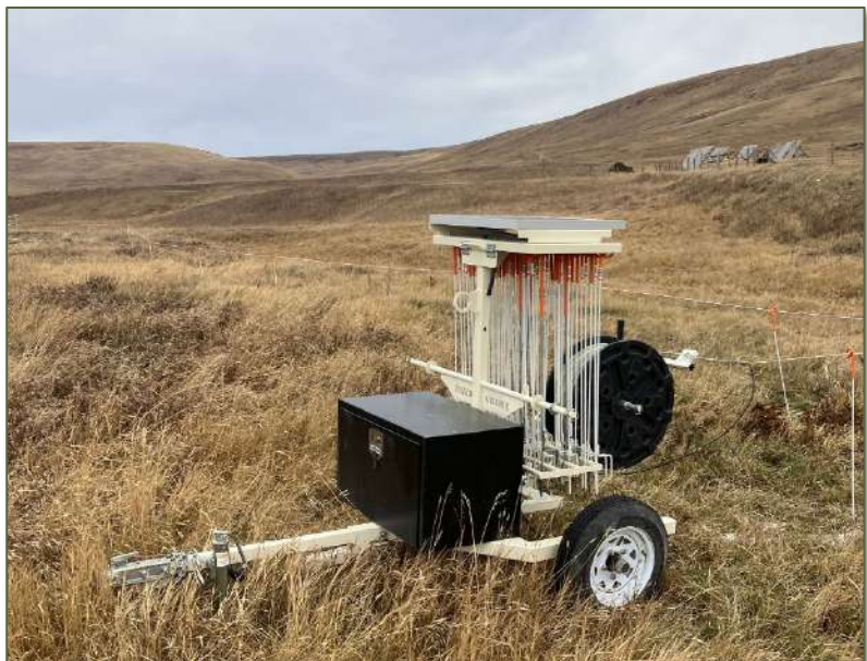
One of several razer grazers facilitated through SALTS in 2023 to facilitate adaptive grazing and range health.