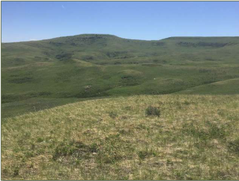
SALTS 2023 easement conserving Foothills Fescue grasslands along the eastern side of the Porcupine Hills.

Here are a few photos from the projects SALTS completed with landowners this year.